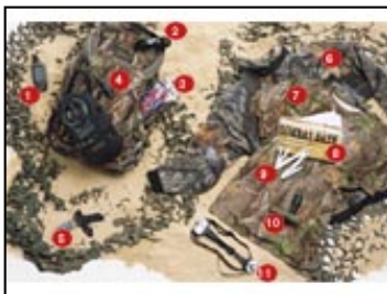
Click here to enlarge

When the military found soldiers buying civilian energy bars, it decided to develop something that met the military's shelf-life requirement and provided